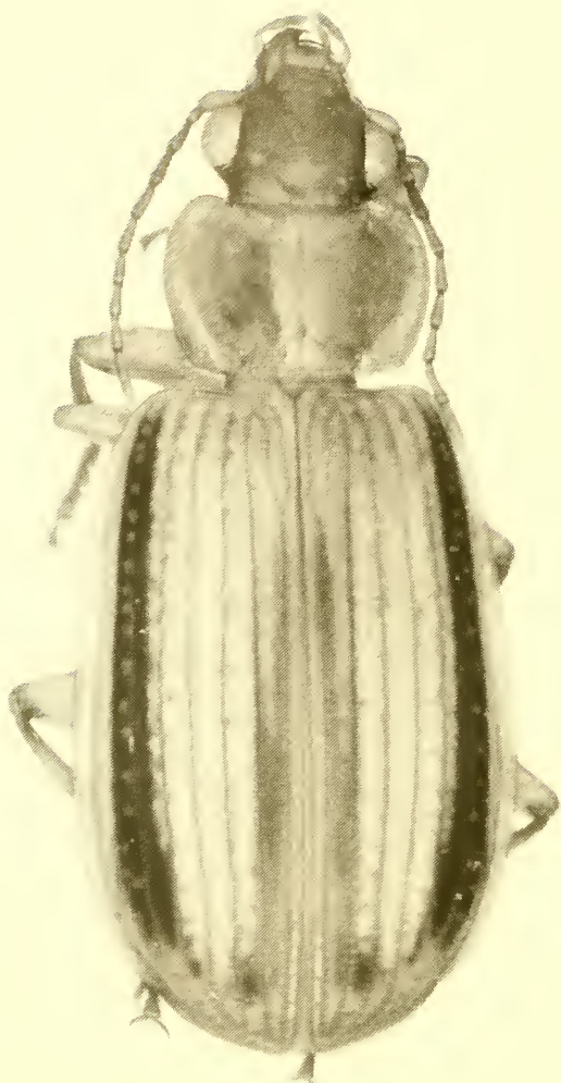
Fig. 1. Amblytelus fallax , spec. nov., holotype. Habitus and colour pattern. Length: 9.5 mm.